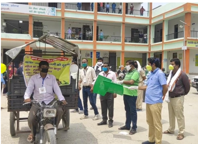
37 migrant workers have already received their cheques in Areraj, East Champaran under this and have started various business activities

Due to the lockdown and the resulting reverse migration, several people had left their work and businesses and as such it became essential to create a business friendly environment for them so that they can restore their livelihoods and gather resources for sustenance. JEEViKA through its strong CBO presence enquired about the relatives and family members of these migrants affiliated with JEEViKA as SHG members, community resource persons or office bearers.